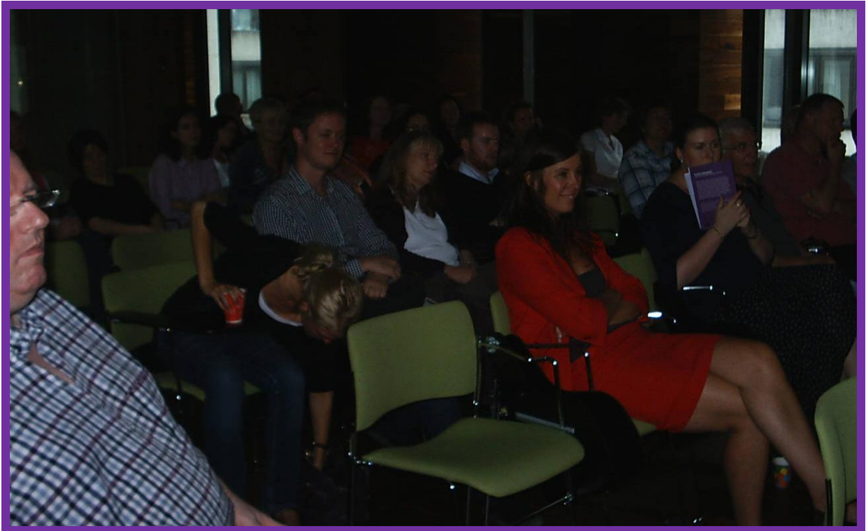
An enthralled audience, well, almost...